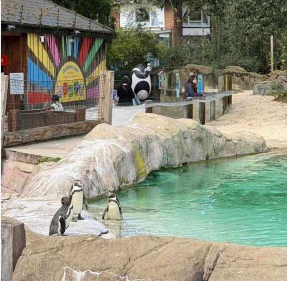
Photo of London Zoo

St Mary's, Rushden & St Peter's, Newton Bromswold