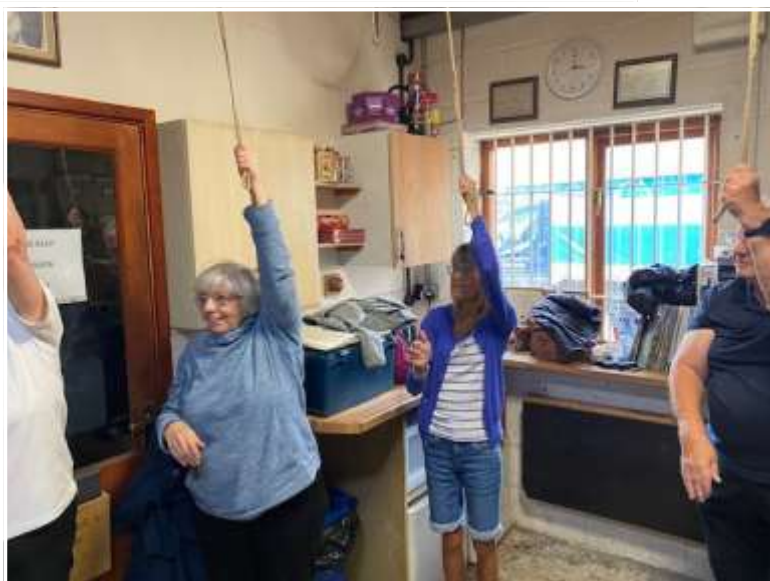
'ringing tiny bells at Whites'