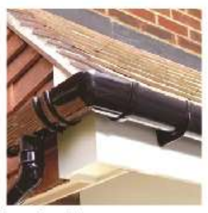
Based in Northamptonshire