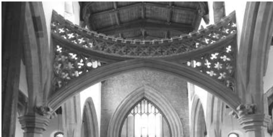
The Strainer Arch

From here is perhaps the best view of the Strainer Arch . This internal arch and similar structures at Finedon parish church and Canterbury and Wells cathedrals are the only examples of this form of architecture in England. It is believed that the same architect was responsible for the earlier Finedon arch. This is an architectural device to combat the tendency for the nave walls to fall inwards. This tendency results from the additional loads imposed on the relatively slender pillars of the nave when, in the same period, the roof level of the nave was raised. The beautiful tracery of the arch was obscured by layers of whitewash for several centuries until a 19 th century curate Rev F M MacCarthy, patiently picked and scraped it away by hand to expose the original stone.