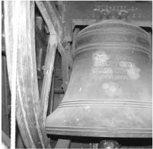
Treble bell, "rehung Coronation Elizabeth II, 2 June 1953"

Between 1969 and 1972 extensive restoration work was carried out costing nearly £20,000. This work involved walls and floors inside the church, and extensive stonework restoration to the west front, tower and spire. It is interesting to note that an even more extensive restoration a century earlier cost £6,000. While the floor of the nave was lifted it was possible to explore the foundations. The basic outline of the original Norman church was identified and the present nave follows the same lines but is somewhat longer. A report of these investigations was made by David Hill in Northamptonshire Past and Present , Vol 5 No 2.