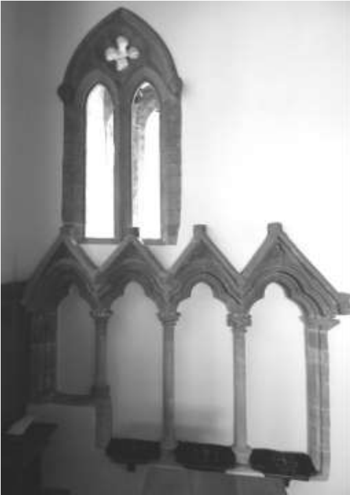
The South East corner of the chancel, showing 13th century piscina (furthest left), sedilia and window.

church, dating from about 1250. The internal window on the wall above, would have originally been an external window, probably housing the sacring bell which was rung at communion, reminding villagers of the worship going on in the church as they went about their daily affairs. E A Freeman, quoted earlier, describes this as a “very curious and elegant window”.