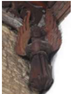
A sample of the angels from the roof in St Mary's Church