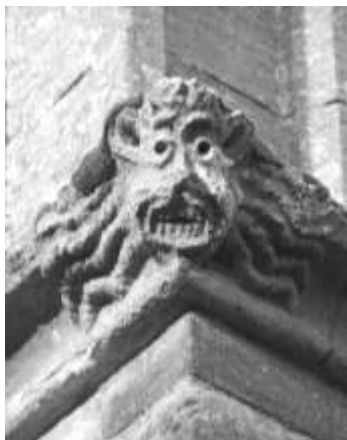
Stone detail from the exterior of the church