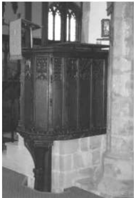
The "Wycliffe" Pulpit

It is known that the Bishop of Lincoln allowed Wycliffe preachers to preach in his diocese. In a space of 35 years (1385 -1420) there were eight rectors which makes it appear that violent changes were going on.